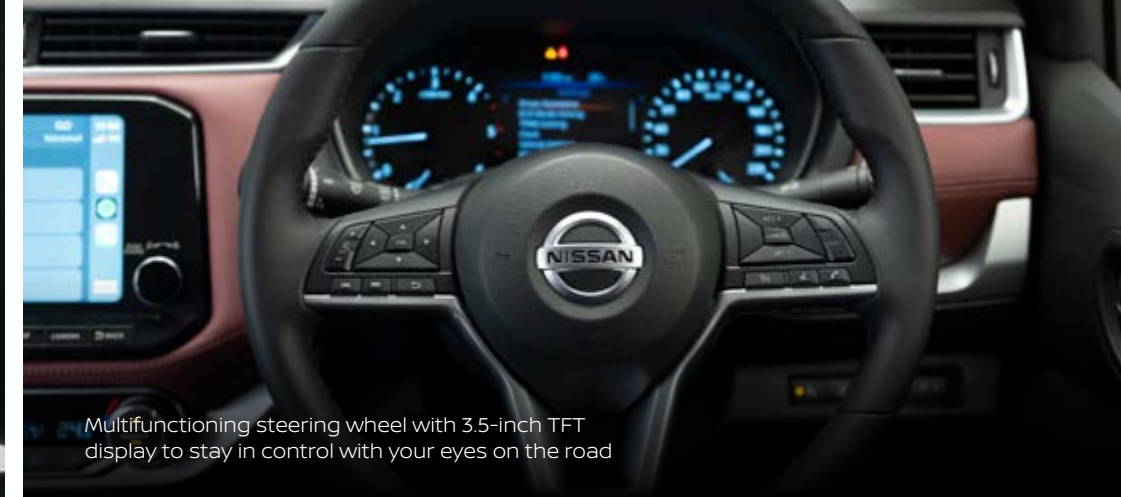
Multifunctioning steering wheel with 3.5-inch TFT display to stay in control with your eyes on the road

Embark on your daily adventures in unparalleled comfort. Expect a sleek driver cockpit and dashboard layout, with plush leather-appointed seats, and a leather stitched steering wheel and gear lever. Control all infotainment from the multifunction steering wheel and let NASA-inspired Zero Gravity front row seats assist in reducing fatigue on those longer journeys.