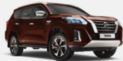
Brown - CAU