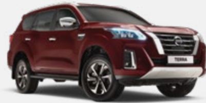
Dark Red - NAW