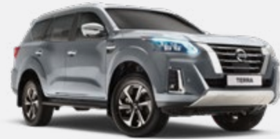
Silver - K23