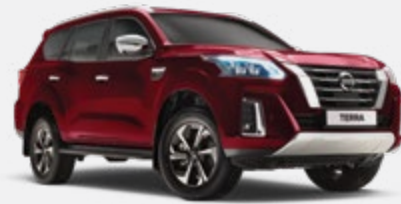
Red S - AX6