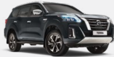
Grey - K21