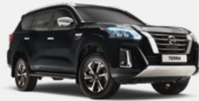
Black - G42