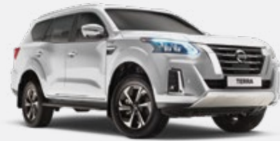
White P - QX1